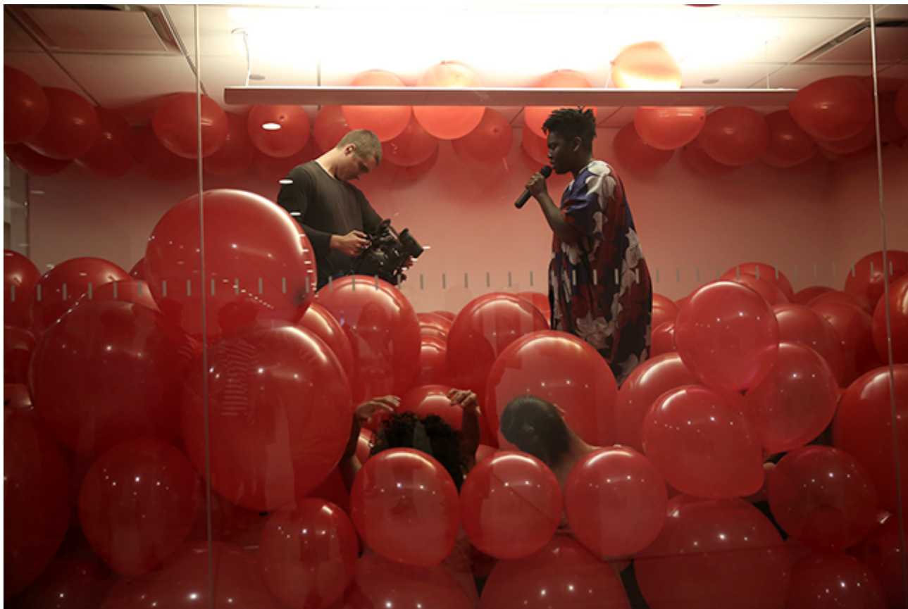
Autumn Knight performs Sanity TV at Whitney Biennial, 2019