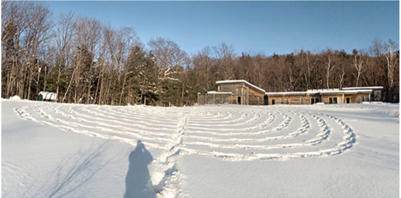
Snow Drawings , Sonja Hinrichsen, 2011